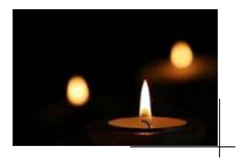
The beauty of meditation, it does not try to kick pain. Pain is treated like a crying baby